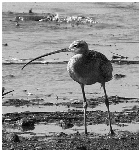
Male Long-billed Curlew