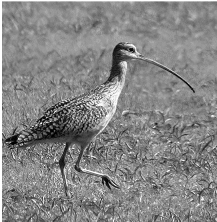
Female Long-billed Curlew

Publications, Inc., New York) said that this species “formerly bred over a large portion of central North America, including all of the prairie region, at least as far east as Michigan and Illinois, and probably Ohio.” In Oklahoma it is now restricted—as a breeding bird—to the western half of the Oklahoma Panhandle. I have been lucky enough to study the species extensively there, and would like to share some of the things I have observed about it.